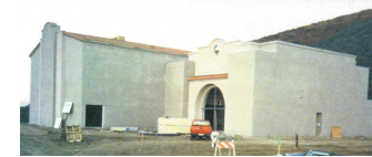
New Hope Church Rancho Penasquitos, CA

Residential Tract Developments, Commercial Tenant Improvements, Institutional (School Classrooms), Custom Residences, Residential Framing, Major Residential Remodels, Apartment Reconstruction (Post-litigation), Public Bid - Bonded Work for School Districts.