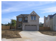
Tract Development Rock Springs Ranch, San Marcos, CA

(Including Owner's Representative Services)