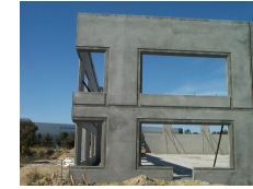
Jon Renau Collections Vista, CA

Align CM also provides services to assist an Owner through the entitlement design coordination and/or construction of projects.