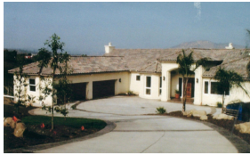
Custom Home - The Trails of Rancho Bernardo, CA

Extensive experience in Residential Development, including tract and custom homes, model complexes, clubhouses, entry and gatehouse structures ( The Cielo entry located in Rancho Santa Fe, CA). Our services and experience also extend to commercial/industrial projects such as the new business home in Jon Renau Collections in Vista, CA (13,000 sq. ft. tilt-up offices and warehouse).